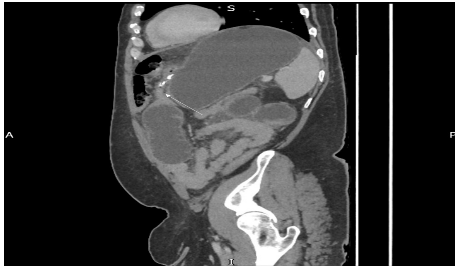
Figure 2. Sagittal Contrast Enhanced CT In The Portal Venous Phase Showing The Dilated Afferent Limb With A Transition Point At The Gastrojejunal Anastomosis (White Arrow).